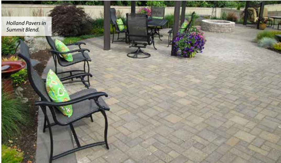
Holland Pavers in Summit Blend.

Holland Pavers offer a simple brick shape combined with the renowned durability of interlocking concrete pavers. Holland pavers are capable of meeting the demands of both architects and engineers for a beautiful, yet durable paving surface. Mutual offers the classic rectangular Holland shape, along with a Double and Triple Holland for increased design flexibility.