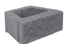
Available in Gray.