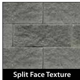
Split Face Texture