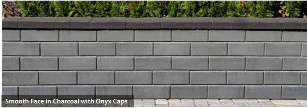
Smooth Face in Charcoal with Onyx Caps

ManorStone® Elite retaining wall blocks feature a hollow middle, reducing the weight per block by 30% compared to traditional non-hollow retaining wall blocks. Our lighter-weight blocks require less energy to lift which can help you save on labor costs and project build time.