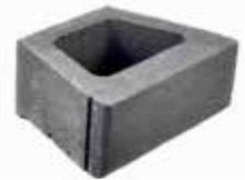
Available in Charcoal and Gray.