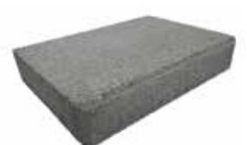
Available in Gray and Onyx.