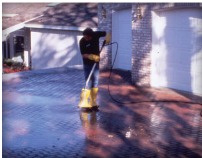
Figure 2. Pressurized cleaning equipment used by professional cleaning and sealing companies can bring out the best appearance from pavers.

Efflorescence is a whitish powder-like deposit which can appear on concrete products. When cement hydrates (hardens after adding water), a significant amount of calcium hydroxide is formed. The calcium hydroxide is soluble in water and migrates by capillary action to the surface of the concrete. A reaction occurs between the calcium hydroxide and carbon dioxide (from the air) to form calcium carbonate, then called efflorescence.