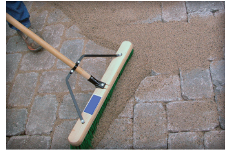
Figure 5. Joint sand can be pre-mixed and delivered to the site (typically in bags), or mixed with stabilizer at the site, then swept into the joints, compacted for consolidation in them to create interlock, and wetted to activate the stabilizer.

of silts or other fines working their way into spaces between the sand particles. The rate of stabilization depends on the amount and sources of traffic, plus sources of fines that work their way into the joints from traffic over time.