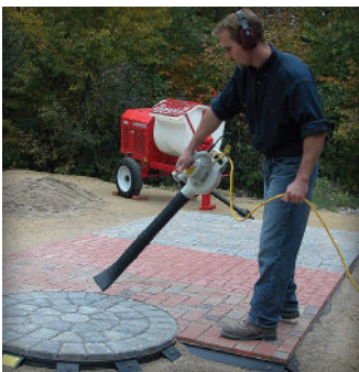
Figure 6. Whether using liquid or dry joint stabilization materials, the surface of the pavers should be cleaned with a blower or broom after the joint sand is compacted into the joints.

These are water or solvent-based with the primary resin or bonding agent being an acrylic, epoxy, modified acrylic, or other polymers as solids (by volume) typically 18% to 28%. Solvent or water carries the solids into the joint sand. They will