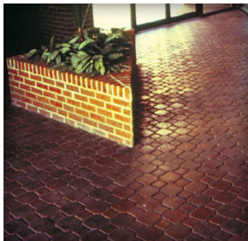
Figure 1. Many sealers enhance the appearance of concrete pavers and protect against staining.

Commercial stain removers available specifically for concrete pavers provide a high degree of certainty in removing stains. Many kinds of stains can be removed while minimizing the risk of discoloring or damaging the pavers. The container label often provides a list of stains that can be removed. If there are questions, the supplier should be contacted for help with determining the effectiveness of the chemical in removing specific stains.