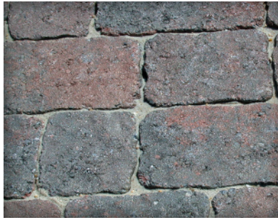
Figure 4. Liquid joint sand stabilizers can deepen the surface color slightly and they provide some surface sealing as well. Tumbled pavers shown here have wider joints than other shapes. These type of pavers can require stabilization of the joint sand.