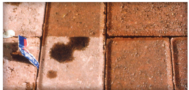
Figure 9. Sealers resist stains which makes them ideal for high use areas where they might occur.

Liquid and dry applied joint stabilizers are not a substitute for recommended installation practices. Prior to their application,