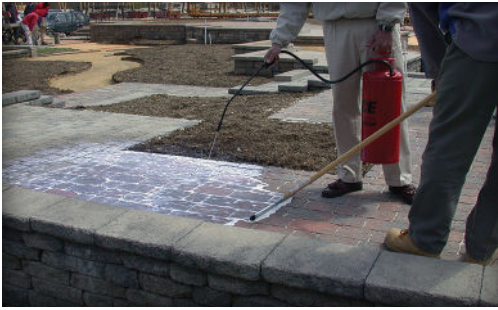
Figure 3. This liquid joint sand stabilizer is applied with a low-pressure sprayer and squeegeed across the surface after allowing some time for soaking into the joints. This helps maintain slip and skid resistance of the paver surface.