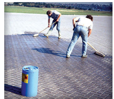
Figure 10. Urethane is applied with squeegees to stabilize joint sand between pavers on aircraft pavement.

If the base under the pavers drains poorly, the sealer is applied to saturated sand in the joints, or is applied too thick, the sealer can become cloudy and diminish the appearance of the pavers. In this situation, the sealer must be removed or re-