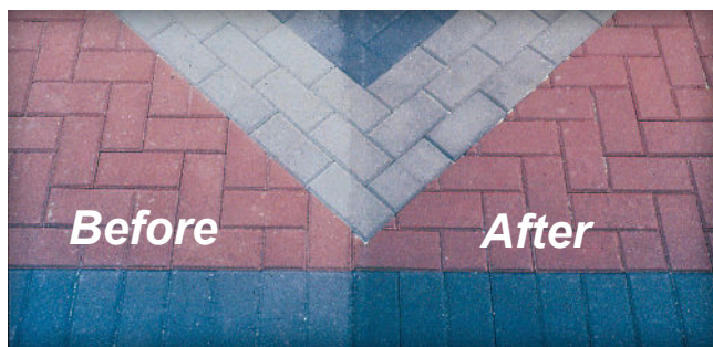
Figure 8. Before and after application of an acrylic sealer shows how it deepens the appearance of concrete pavers.

These are dry additives mixed with joint sand. The additives are organic, inorganic, or polymer compounds that stiffen and stabilize the joints when activated by water applied to the joint sand. Additives come either pre-mixed with bagged joint sand, or are sold separately as an additive mixed with the joint sand on the job site per the supplier's instructions. The additive is